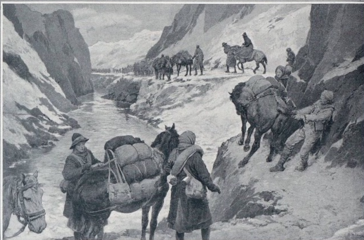
An Incident in the Great Serbian Retreat—British Nurses Crossing the Mountains of Albania